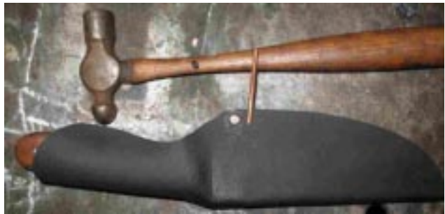
left over electrical wire (#12) makes quick and easy rivets. I use a rivet at the top and bottom of the seam.

The final profile can be acheived with a bit of carefull grinding. I used a 60 grit belt but it isn't critical. Once you are happy with the profile, a couple of light rivets ought to be added to insure the seam won't open. I found that a #43 bit and some